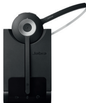
The Jabra PRO™ 925 wireless headset makes it easy to handle calls from your desk phone and provides hands-free communication up to 100 meters / 300 feet. Optimized for high density office environments.

The Jabra Pro 900 series is 100% software based, allowing you to upgrade your headset without incurring additional